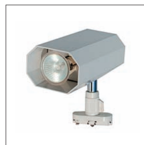
Spot halogen SY STAR 50W(A) EUR 21.00 Cod 019.010.186.000