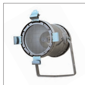
Reflector HIGHLITE HQI 150W EUR 45.00 Cod 019.010.390.000