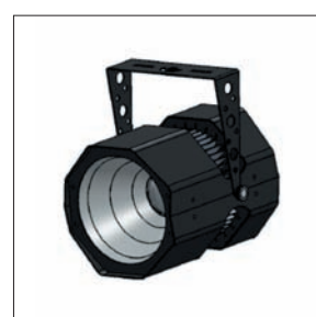
Reflector LED VIRGO 40W 4350 LM 4100 K EUR 50.00 Cod 019.010.200.045