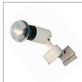
Lampa spot SS30 100W EUR 18.00 Cod 019.010.200.008